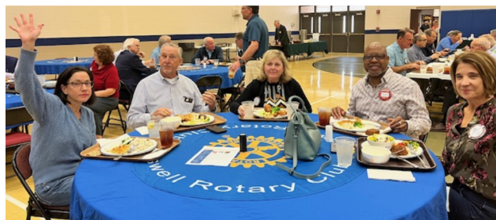
We all dance in our own ways!