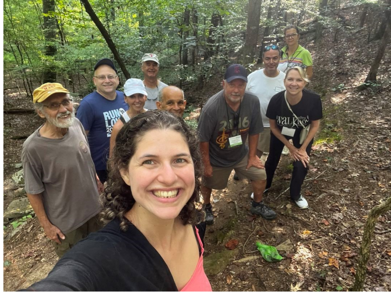
Walkers at Island Forge on Saturday, Sept 9 Next walk is Saturday, October 21